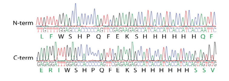
Figure 2. A sequence trace of the Strep/6 xHis tag inserted into the cDNA of the SHT_{2C} -receptor. The amino acid sequence of the tag is shown in black and the sequence of the receptor is shown in green.

The megaprimer was then used in site-directed mutagenesis reaction to insert the tag at the desired location by PCR based methods. The correct insertion of the tag was confirmed by sequencing the resulting plasmid. Figure 2 shows the sequence of the tag within the SHT_{2C} -receptor sequence at both locations. The nucleotide sequence of the plasmid in the region of the tag matched exactly with the template cDNA, containing the tag in the proper reading frame proves that the correct tag was inserted at the desired location.